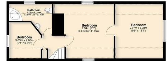
Second Floor Approx. 58.2 sq. metres (626.4 sq. feet)

Total area: approx. 246.0 sq. metres (2648.3 sq. feet)