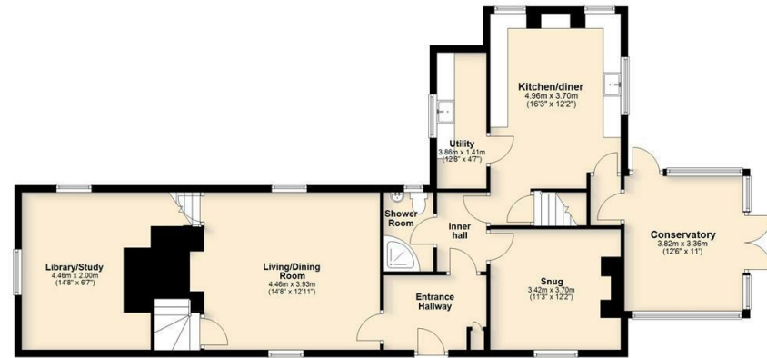
Ground Floor Approx. 108.8 sq. metres (1171.4 sq. feet)